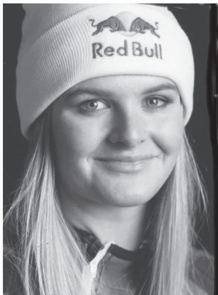
Upper: Marco Odermatt. Lower: Lara Gut-Behrami and Alice Robinson.