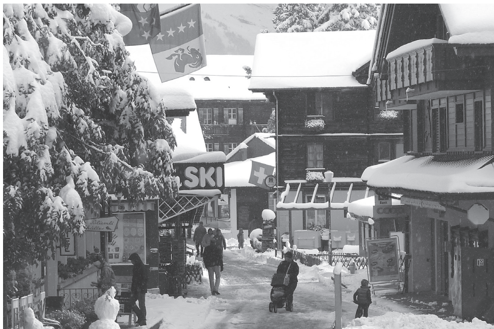
Modern Murren.