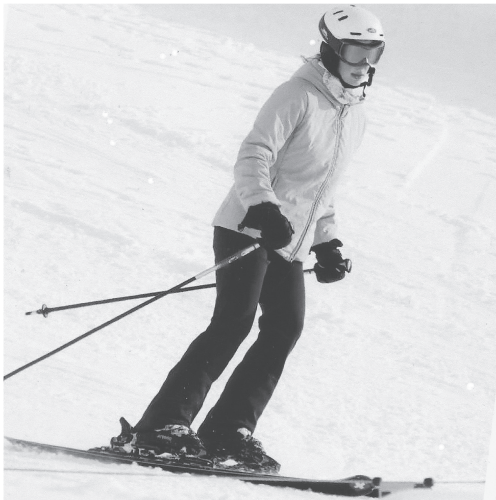
Louise Windsor, aged 20, who is 16th in line to the British throne, skiing at St Moritz (Switzerland) this year.