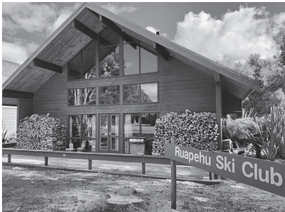
Upper: Painting the Lodge roof in February 2024. Lower: Firewood stored at RSC Turoa.