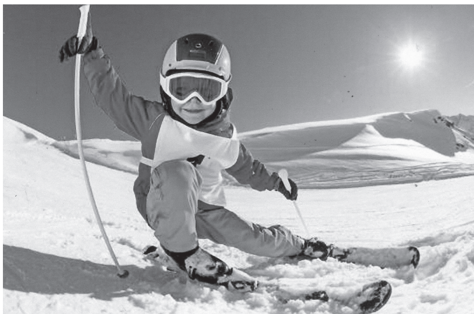
Children skiing at Ruapehu.