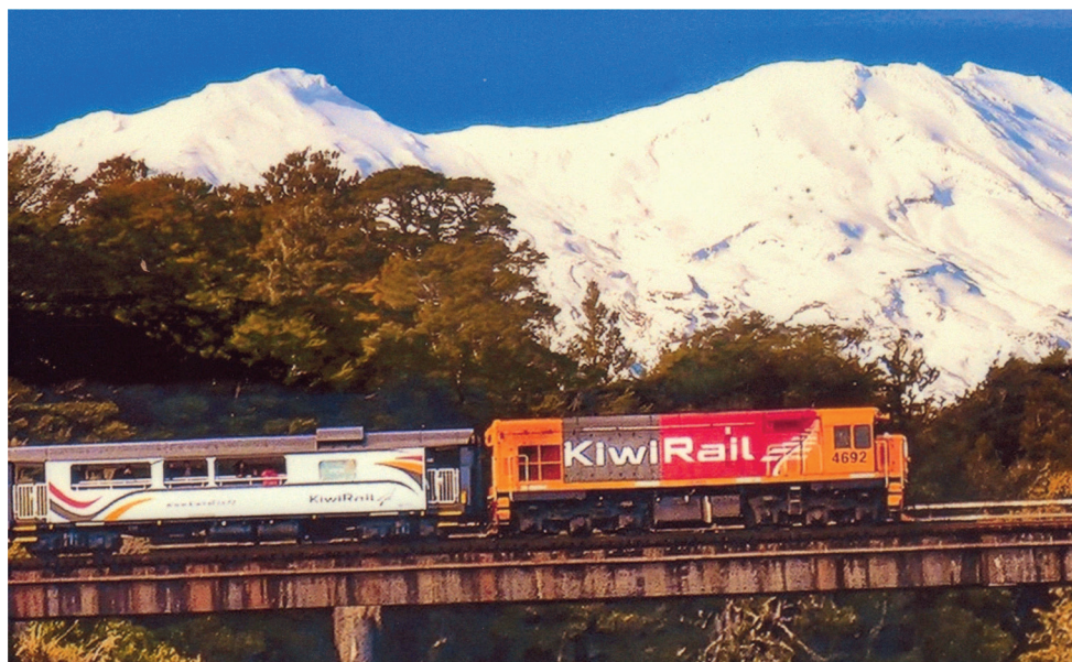
Upper: A field of 16,000 skiers sets out in the Vasaloppet 90km race in Sweden. Lower: The Northern Explorer passes Mt Ruapehu.