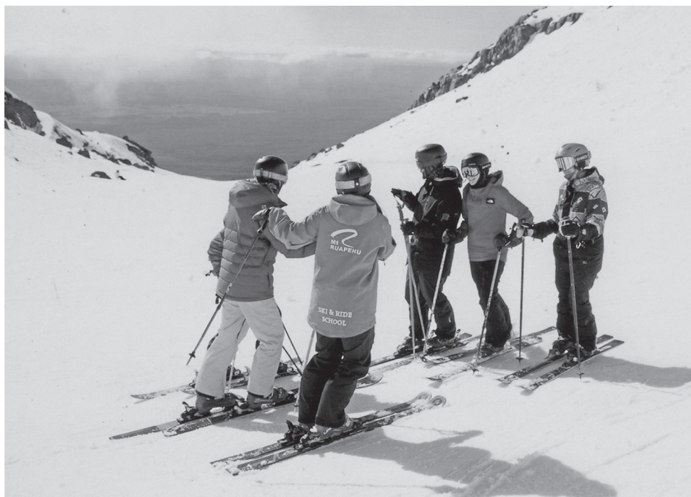
Skiing at Whakapapa.