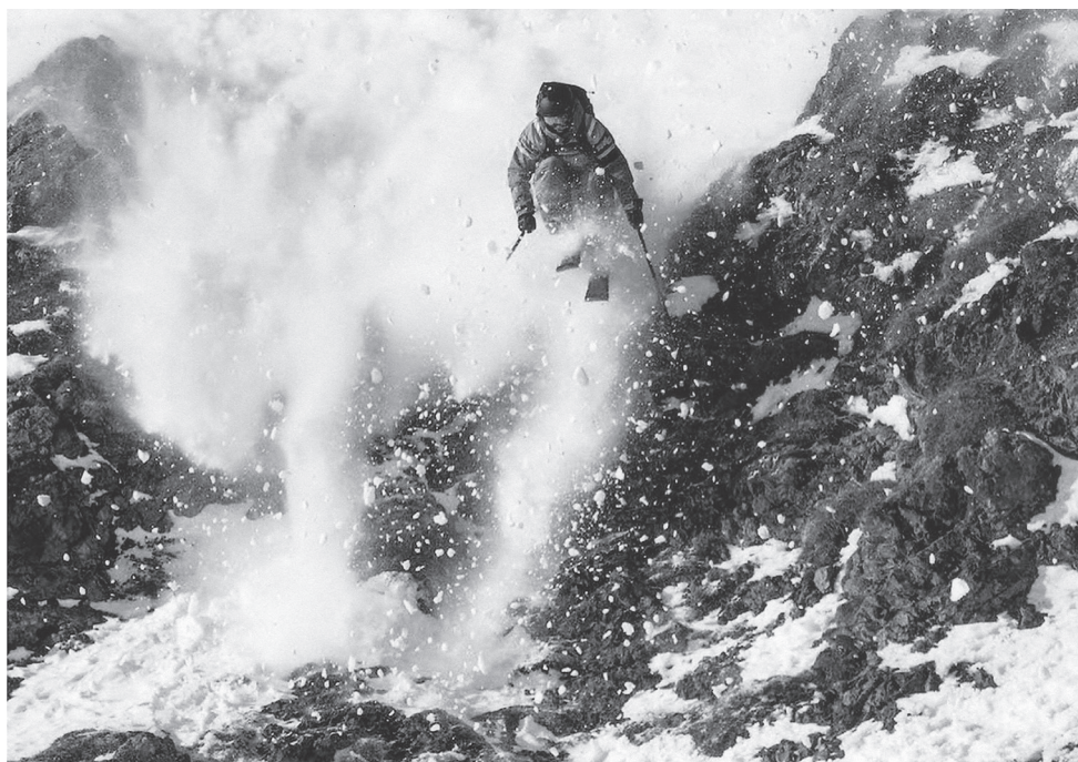
Upper: Interclub racing at Whakapapa. Lower: Alan's favourite freeride photo. No idea where it is.