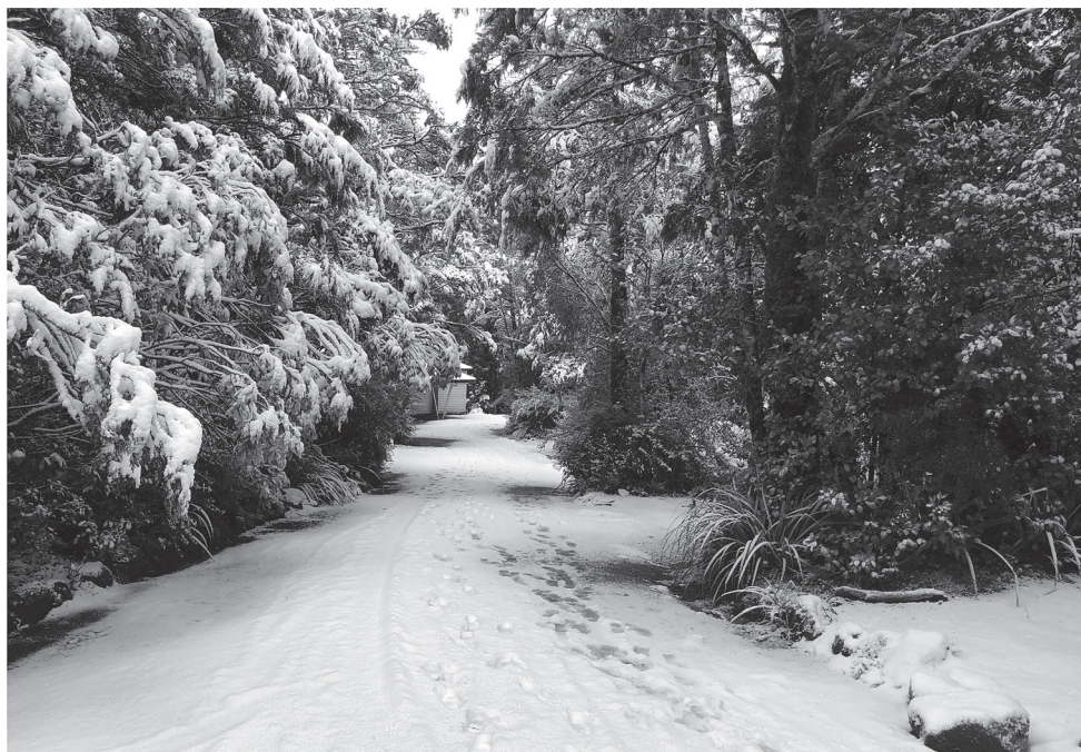
Snow right down to Chateau level in the 2023 ski season.