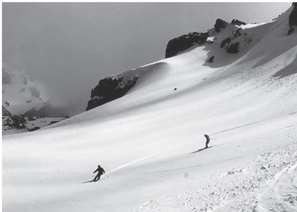
Skiing at the Tukino skifield on the eastern slopes of Mt Ruapehu.